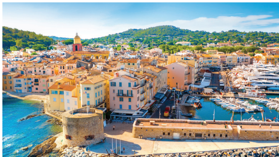
Above: Menaggio old town on Lake Como Below: Saint-Tropez, Provence, Cote d'Azur

Having tied the knot in Saint Tropez, John Legend and Chrissy Teigen are often spotted in the area, as well as Emily Blunt and John Krasinski who were also married in the area.