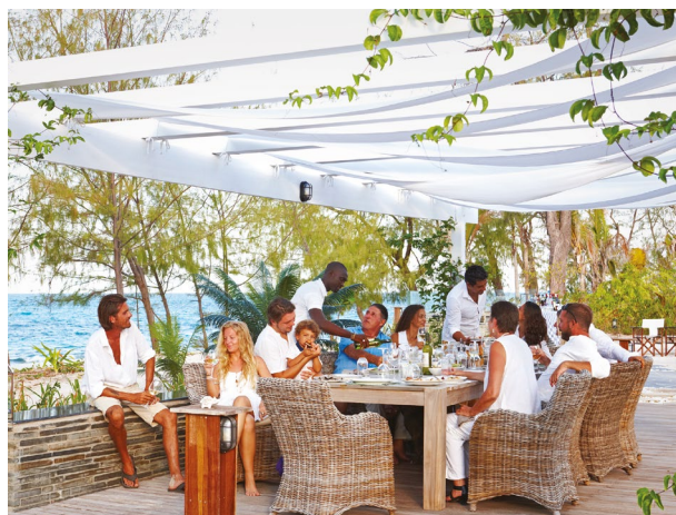
Left: Private Villa jacuzzi and luxury dining at Thanda Island in Tanzania Below: Shower with a view outside a Six Senses Zil Pasyon villa in The Seychelles Bottom: The naturally shaped Cempedak villas blend into the Indonesian wild habitat for ultimate privacy and relaxation